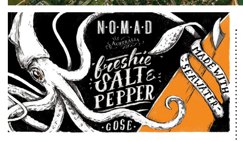
Freshie Salt & Pepper

STYLE: GOSE - Using real sea water harvested from Fresh Water Beach - Sydney Colour: Golden / ABV: 4.5% / IBU: 15