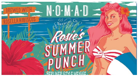
Rosie's Summer Punch

Formats: 24 x 11.2oz / 330.0mL 4-pack Can(s) Bar-code: 9349064000634